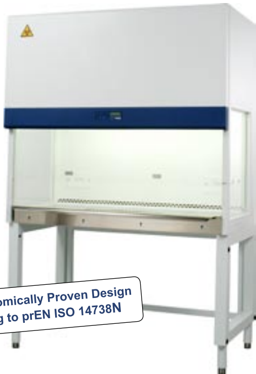
Standard 4ft model on an optional support stand with levelling feet

New Ergonomically Proven Design According to prEN ISO 14738N